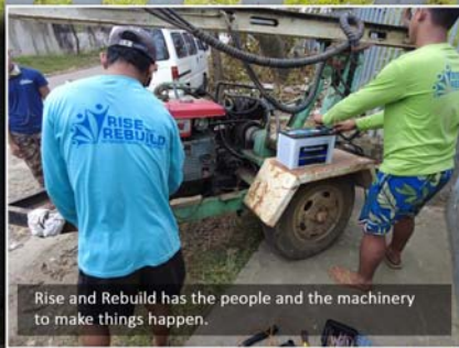
Rise and Rebuild has the people and the machinery to make things happen.

Location: Hiway 77, Talamban, Cebu (first among the many abandoned wells to be rebuilt by the Foundation)