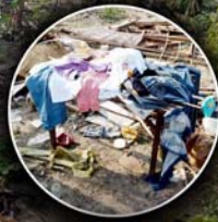
The table they were clinging for their lives.

One of the most terrifying stories we've heard is from this family that lives in this totally devastated house. It consists of 3 daughters and their mother, no boys. At 4pm, as typhoon Odette starts to blow Bohol, their caring Church leader came by to conduct one last round call for safety evacuation. For some reason, they opted to stay. Then by 1 am, their Church leader received a message them requesting for rescue. But those hours are at the peak of Odette's strength, and it was too risky to go out. So they waited till the storm calm down. They got into their house 4am, and they were shocked to see the place. They learned that while waiting for the rescue, they all stayed together under this table crying and praying for their lives, in total darkness, while strong winds at the speed of 260 to 290 kph continued to batter their house. It was a terrifying moment that anytime they could be hit by flying debris or be blown away. They may have lost their house, but they all survived. They are one of those that will be built with the Amakan house.